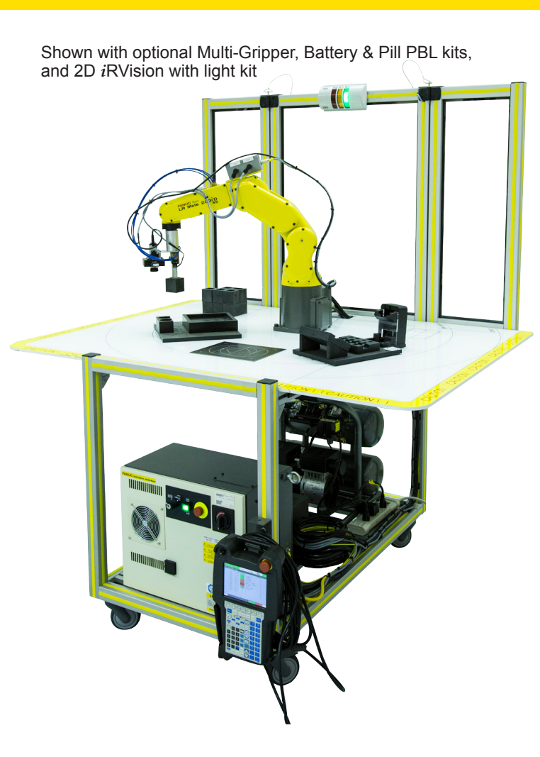
Optional Multi End-of-Arm Tooling package and iRVision hardware